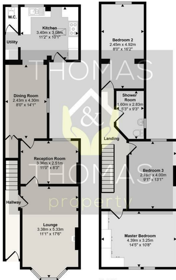
Ground Floor Approx 57 sq m / 611 sq ft

Approx Gross Internal Area 109 sq m / 1171 sq ft